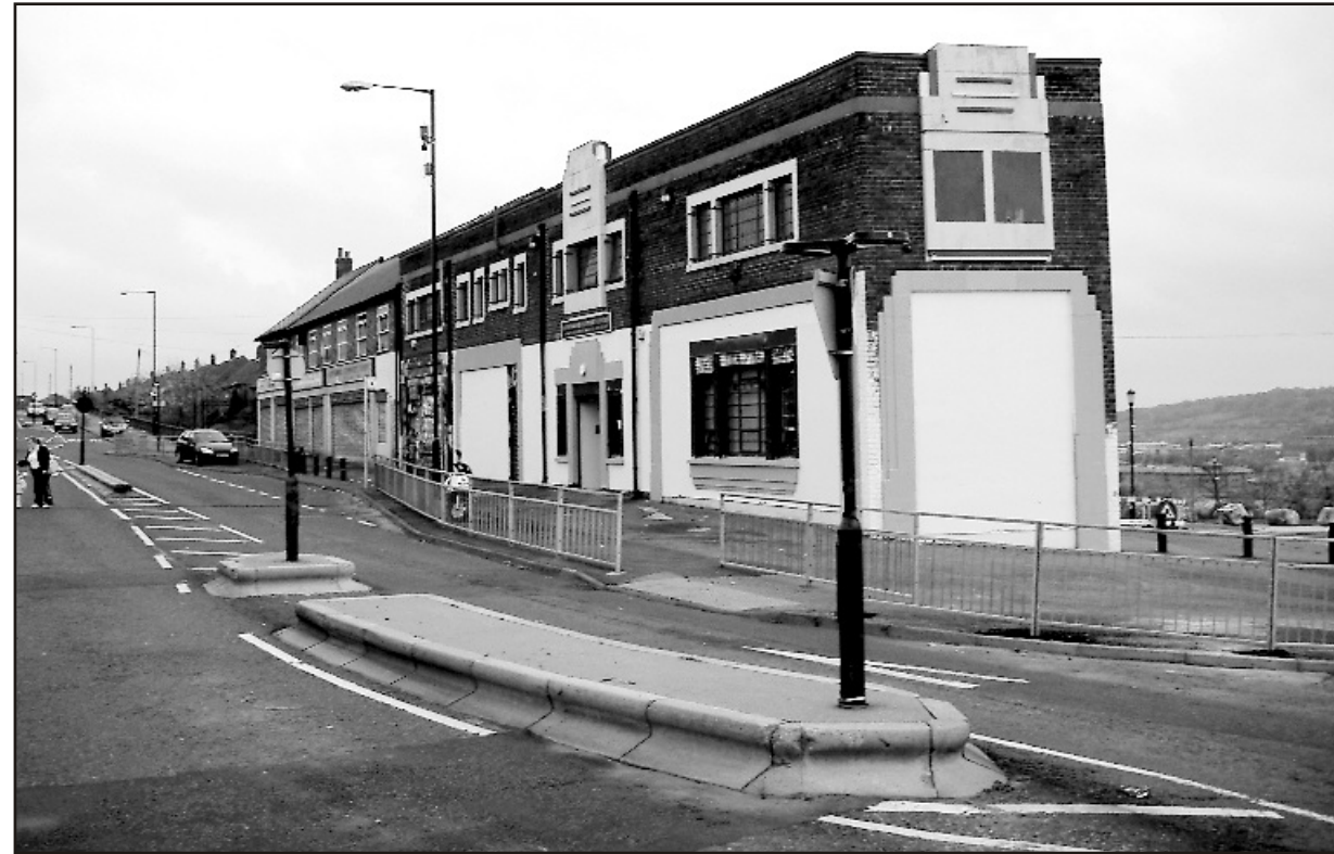
FACING AXE: above, the Pink Palace on Armstrong Road has served the community for eleven years, while residents discuss what they would like to see for the future of Scotswood, below.