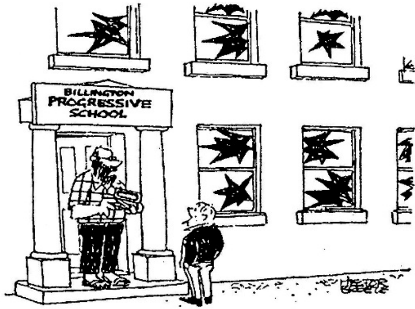
"Very well, Geoffrey - you have received fair warning. I am going to confiscate your brick."